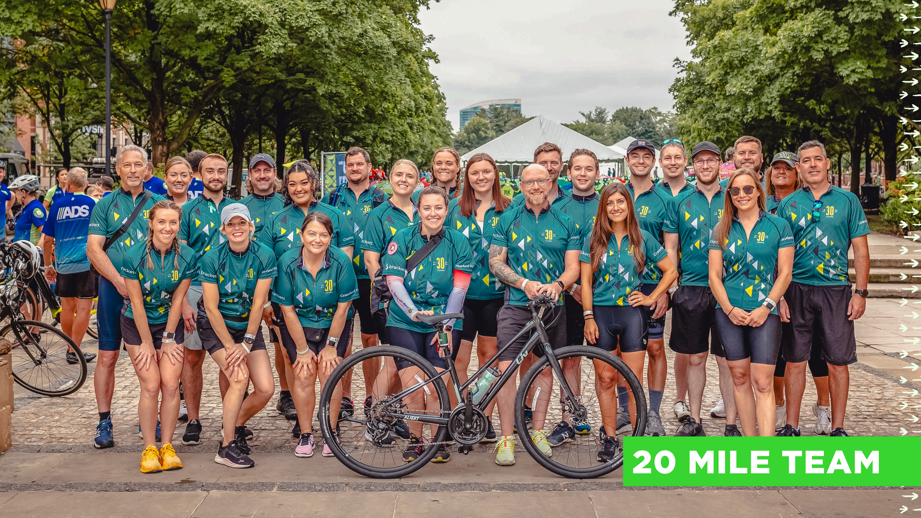
20 MILE TEAM